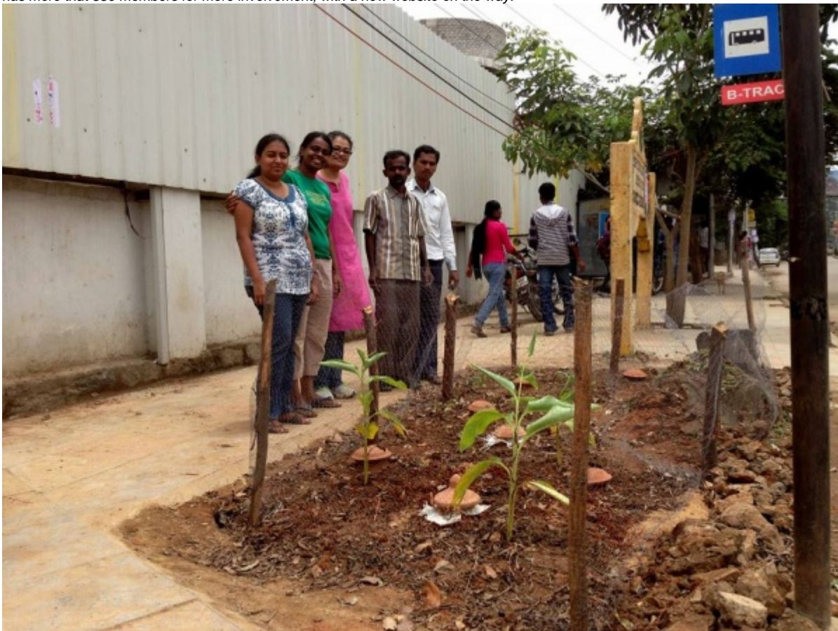
The biggest challenges

One challenge the group faces is to impressing upon the minds of the residents of Whitefield that they have it in their hands to make a difference without having to turn activists and invest huge amounts of time or money. Encouraging leadership, with the "Tree" issue the group just needs one individual who signs up to say, "Give me some resources and I will figure out where to take us." There is no dearth of successes elsewhere, as demonstrated by the residents of Koramangala 3rd Block who ensure that their old trees won't see the axe. Understanding how to have a dialogue with the government, collaborate and get things done in