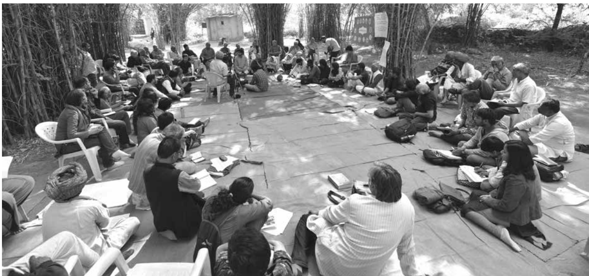
Participants at the National Sangam, Udaipur, Rajasthan, November 2017.

What other sectors and aspects should be listed here?