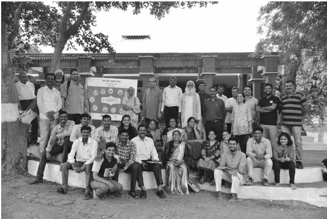
Participants at Madhya Pradesh Vikalp Sangam, September 2017.

Not everyone may agree with all of this, but it is proposed that we can discuss the specifics of the problem elsewhere, while here we move towards what we think the paths and visions forward could be, based on broadly shared sense of the crises. As part of this we also need a greater political understanding of and within local initiatives, and of resistance movements, and through these to create larger solidarity of struggles. And the ability to convey that a search for alternatives is not about everyone retreating into states of scarcity and deprivation, but of having real wealth 3 within the context of sustainability, justice and equity 4 . A society that embodies the ancient notion of swaraj: autonomy and freedom with responsibility, both individual and collective; respect for all life; and self-restraint that comes from the deepening of ethical or spiritual enquiry.