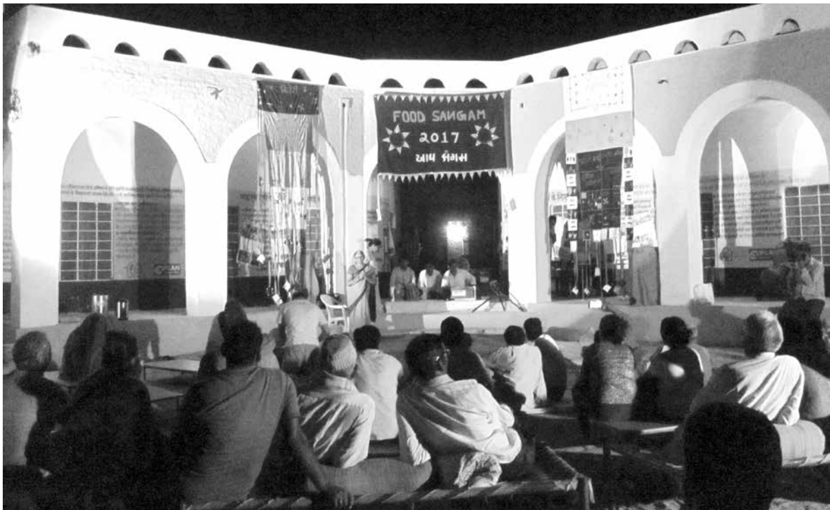
A cultural event connecting food with folk music, Food Vikalp Sangam, Bajju, Rajasthan, October 2017.

Purely elitist food fads even if they pertain to healthy or organic food, are unlikely to be considered as alternatives.