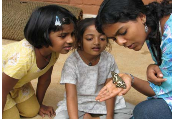
Spell bound moments at Isha Homeschool, Coimbatore

What happens if you sometimes have surplus unsold green vegetable crops? No worries. Take them, chop and mix them with jaggery and water and leave for two weeks. You get a beautiful fermented tonic solution for the soil microbes' to multiply. Strain and spray on the soil.