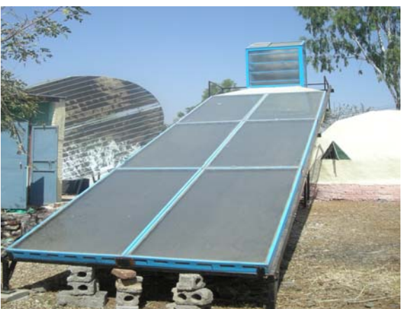
Solar drier constructed and erected by students