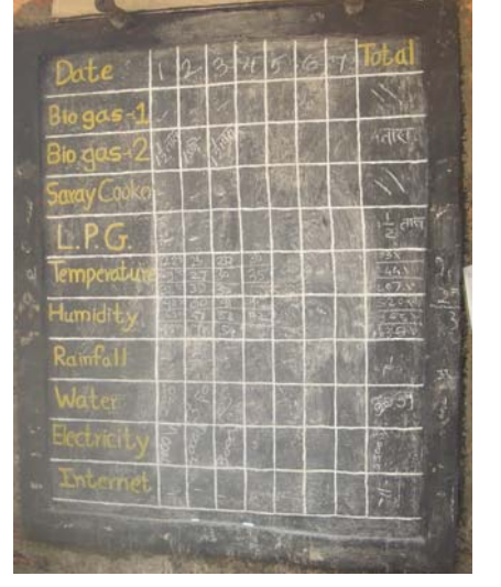
Record keeping is an important activity at Syamantak

build-ings, make architectural drawings, carry out constructions, identify flora and fauna and even handle snakes, analyse blood, soil and water samples, sew and knit and do much more. The nuances of figuring out how things work, is done very simply by pulling things apart and then reassembling. Be it a cycle, generator set or a motor bike, there is no restriction on the child to have a go at dismantling it into its individual components of nuts, bolts, plastic, glass, wires and metal.