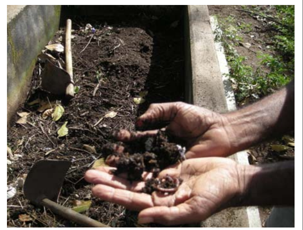
Vermiculture at Kattanbhanvi, Karnataka

What about termites and earthworms? If the soil is moist and loamy it is good for earthworms. If the soil is dry and acidic it is good for termites. Depending on the soil conditions either of them will appear, both are good, both do the job efficiently. The only problem with termites is that they will attack the wood in the house. Termite compost is not as rich as earthworm compost because termites are active organisms; they use the nutrients from the soil for their own requirements. What passes through the earthworm is still rich in nutrients as earthworms are relatively sedentary. Children can learn the ecological classification of earthworms - surface level, middle level or deep soil worms; how are they useful at each level? What about termite mounds, they look so impressive that they would surely have some utility. Termite mound soil if mixed with cow urine can be used to treat seeds for germination or for storage. It gains pest repellant properties. Children can learn these simple techniques which they can readily apply on their