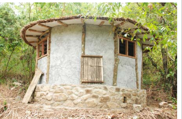
Hideout for bird and animal observation and study at Sholai