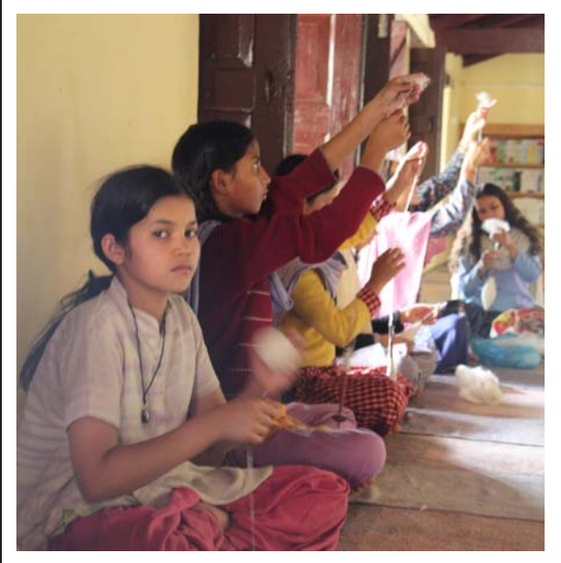
Everyday life at the Ashram