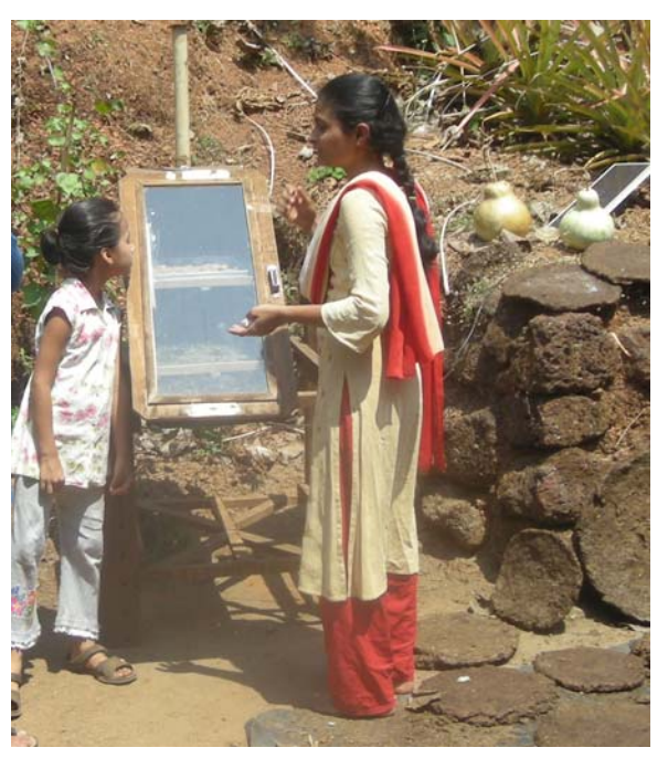
Solar drier and cowdung cakes being dried for preparing washing powders developed in-house

build-ings, make architectural drawings, carry out constructions, identify flora and fauna and even handle snakes, analyse blood, soil and water samples, sew and knit and do much more. The nuances of figuring out how things work, is done very simply by pulling things apart and then reassembling. Be it a cycle, generator set or a motor bike, there is no restriction on the child to have a go at dismantling it into its individual components of nuts, bolts, plastic, glass, wires and metal.