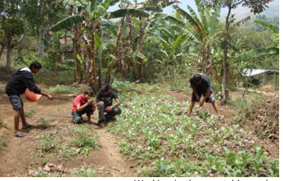
Working in the vegetable garden