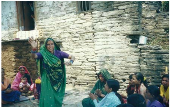
Community participation in the balwadi school programme in Uttarakhand. Young teachers seen cheering. School building in the background.

The teacher manual will need to highlight these aspects or explain the role of the facilitator who may have a rather round the clock job while dealing with certain aspects. The teacher would have to be an informed expert. Since most of us would be conditioned by conventional learning it would be difficult to shake off the old habits. It has to be accepted that this curriculum by its very nature is a leap beyond conventional learning. This is only to illustrate the challenge that the curriculum offers. It is an opportunity for making learning a practical creative experience. On the other hand, if one were to follow a conventional method then the entire module of cattle rearing or poultry or mushroom cultivation or bee-keeping would demand setting up of highly specialised and terribly expensive infrastructure and require systematically planned topic wise activities to deal with each module. The entire purpose is to break out of the mindset of a structured learning arrangement and use the outdoors as the classroom and make the best of the natural system unfolding around.