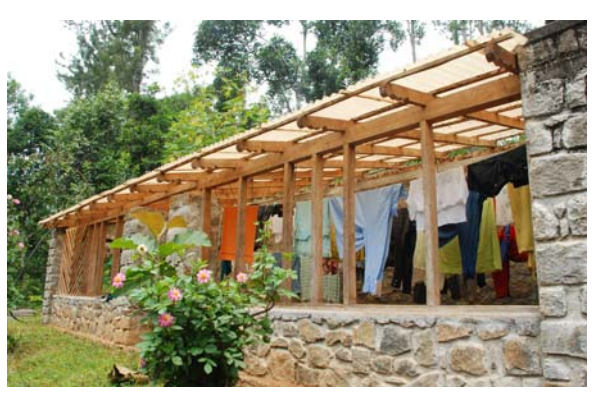
Drying space constructed by students of Sholai