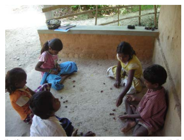
The "five stones" game being played with jungle seeds by children at Thulir

Although most of these activities may begin as a hands-on task, the theoretical aspects are integrated at the appropriate time. Much emphasis is placed on keeping records of work, material, procedures and care of tools and equipment. It is here that the student feels the need