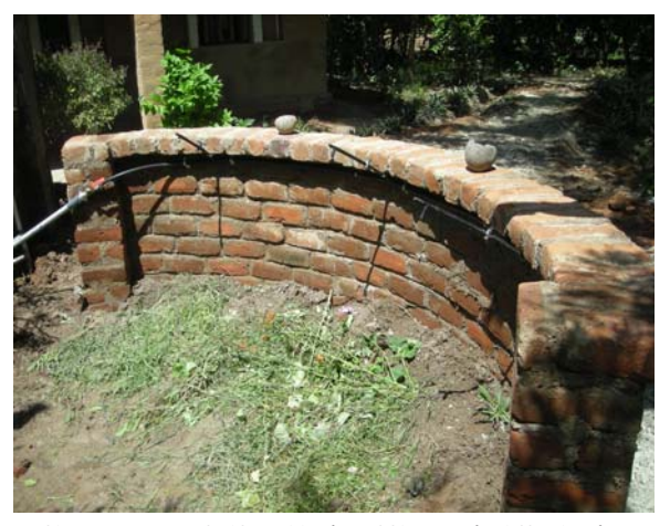
Washing area constructed with provision for mulching, use of sprinkler pipes for taps

The activities with the younger children are more in terms of play, where the main aim is to motivate them towards self learning. The activities are designed such that a balance of the three components – the head (academic), the heart (aesthetics, art, music) and the hands (farm related