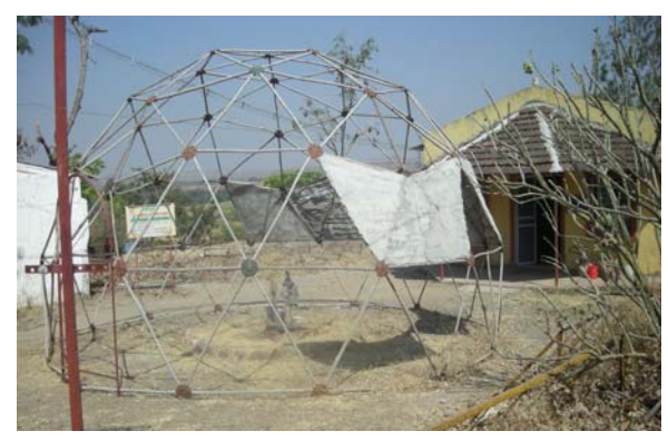
Earthquake resistant dome constructions designed at the Ashram

Introduction to Basic Technology (IBT is offered to the students of 8th, 9th and 10th standards along with other subjects. The programme is recognized by the education board of Maharashtra and is also offered through other schools in Maharashtra. One day per week is allocated for this course. Each school is required to have minimum facilities like engineering workshop, electrical section, agricultural land, poultry, and food and health labs. Instructors are entrepreneurs from within the community, while students learn as trainees; the services are paid for by the community. All assistance to introduce the programme in schools is offered by Vigyan Ashram.