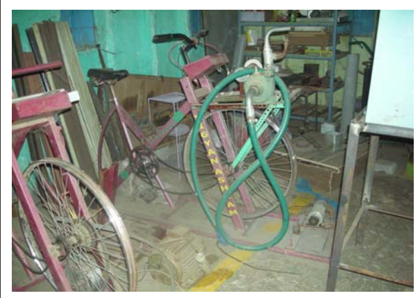
Improvised cycle with a motor attached for generating electricity

Diploma in Basic Rural Technology (DBRT) is a one year residential course recognized by the National Institute of Open Schooling. The minimum qualification for eligibility is eighth standard. It is a multi-skill program where all