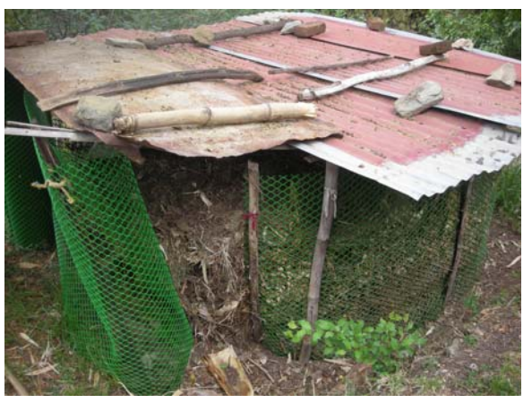
Composting at Mitrola Ashram, Almora, Uttarakhand

Tremendous heat is generated during the composting process; this heat can be used to heat water or prepare fermented biological pest repellant preparations. That again is very easy. Take the goat out for a stroll; observe very carefully the plants that it avoids eating. Collect a hand full of leaves from half a dozen such plants, crush and put them in a pot with water, leave it to ferment for two weeks in the compost pit. It would have gone through a biological process. You will have a sticky substance sticking to the pot, dilute it, mix it up, strain, add cow's urine and let it ferment for a day,