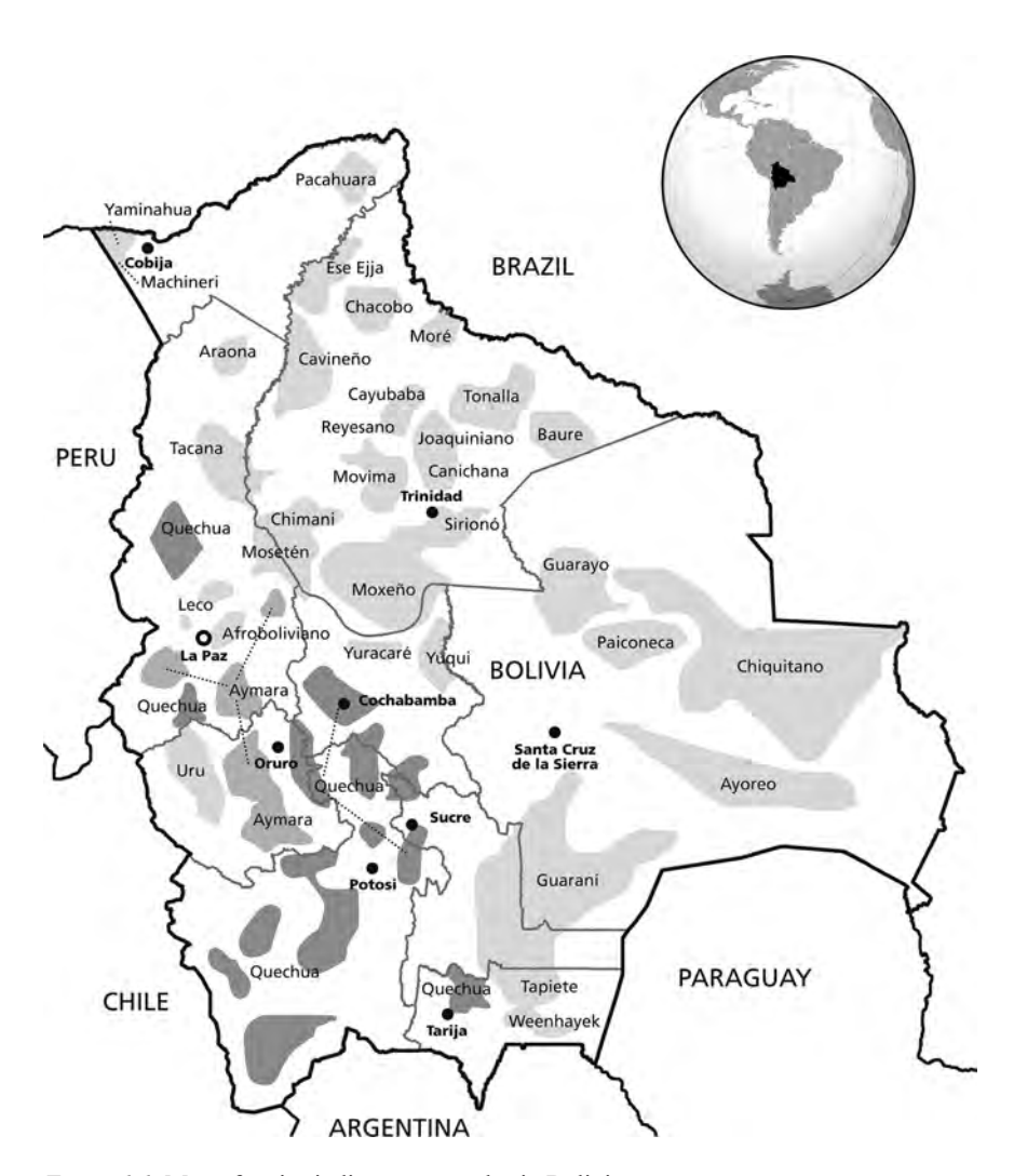
Figure 1.1 Map of major indigenous peoples in Bolivia