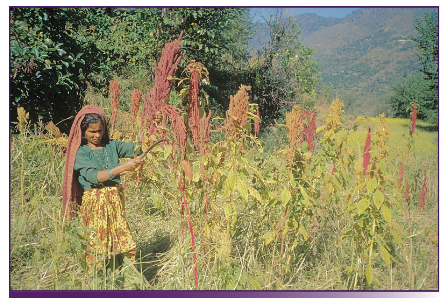
Traditional crop diversity conserved by Beej Bachao Andolan, Uttarakhand