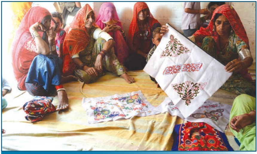
URMUL's work with women craftspersons near Bikaner, Rajasthan, has helped generate self-confidence and livelihoods