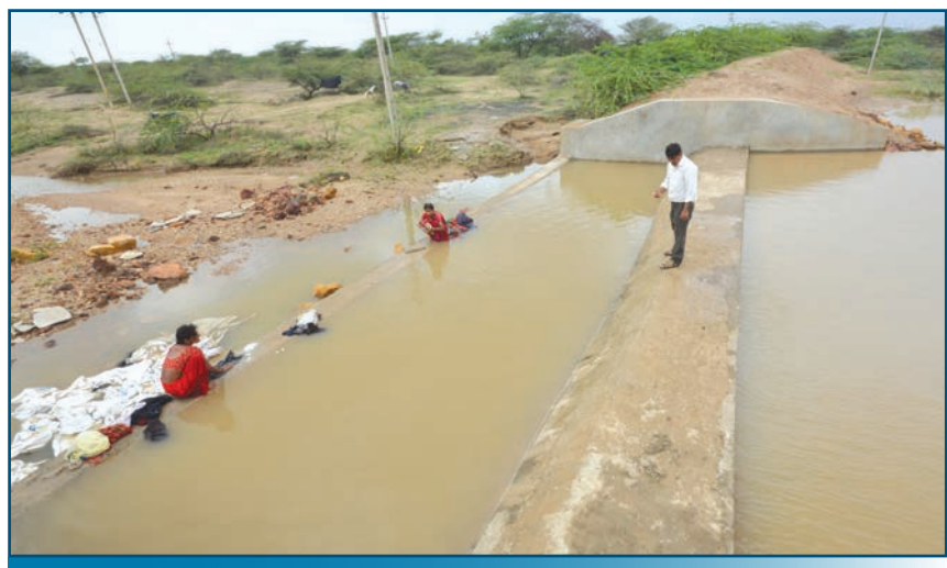
Decentralised, locally managed water harvesting and socially regulated use in India's driest region, Kachchh

of communities in arid and semiarid areas by resolving ecological constraints through facilitation and access to technologies or institutional solutions. The focus is on groundwater management and urban watershed management (http://www.kalpavriksh. org/images/alternatives/CaseStudies/ KachchhAlternativesReport.pdf and http://act-india.org). Many more examples are available on India Water Portal (http://www.indiawaterportal.