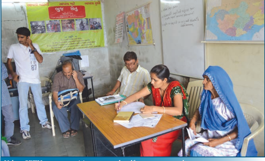
Urban SETU empowers citizens towards self-governance and greater government accountability, in Bhuj (Kachchh)

Some examples reflect the above. The 30-year old story of Mendha-Lekha, a village that has taken control over its commons and declared that for itself, it is the government, is iconic. It has successfully enforced the long forgotten Maharashtra Gramdan Act of 1965. Through this act the villagers have donated their entire agricultural land to the village Gram Sabha to strengthen it and also secure their land rights (Pathak and Gour-Broome 2001 and http://www.vikalpsangam.org/ article/mendha-lekha-residents-giftall-their-farms-to gram-sabha/). A decade-long experiment at ecoregional decision making through a people's parliament ran in the Arvari basin in Rajasthan (Hasnat 2005). There