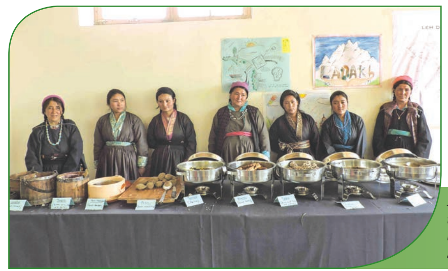
Ledo Village women's group with traditional recipes using local biodiversity, at Ladakh Vikalp Sangam, July 2015