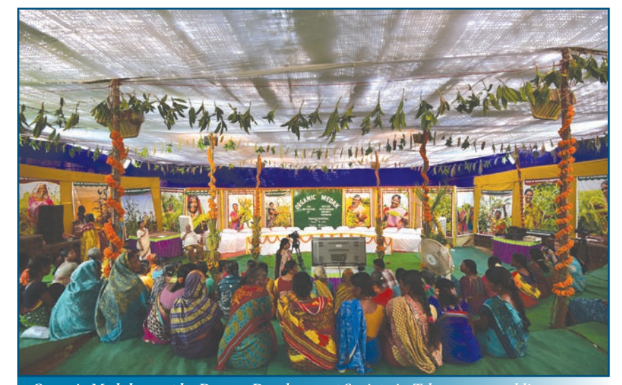
Organic Medak event by Deccan Development Society in Telangana: enabling dalit women to gain socio-economic dignity and decision-making power

There are thousands of examples of community conserved areas (CCAs) across India. CCAs are areas where humans and wildlife co-exist. In these times when biological diversity is under grave threat, conservation