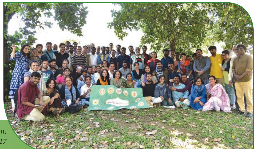
Participants of Youth Vikalp Sangam, Bhopal, February 2017