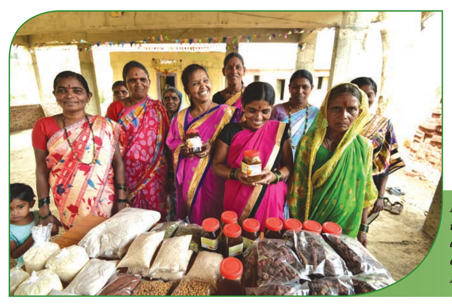
Members of women's self-help group in Bhimashankar (Maharashtra), displaying products in honey festival organised by Kalpavriksh & others, April 2017