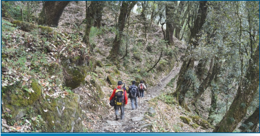
Zero-waste trekking trail at Khangchendzonga National Park, Sikkim

efforts of the local communities gain immense significance (http:// www.kalpavriksh.org/index. php/conservation-livelihoods1/ community-conserved-areas). Even in urban areas, there have been attempts to revive ecosystems in Bengaluru (http://vikalpsangam. org/static/media/uploads/Resources/ kaikondrahalli_lake_casestudy_ harini.pdf), Udaipur, and Salem. Jheel Sanrakshan Samiti, a people's organisation formed by concerned citizens of Udaipur in regard to water management and pollution crises has worked tirelessly to ensure lake rejuvenation and combat water issues in the city (http://vikalpsangam.org/ article/anil-mehta-a-man-with-amission/#.ViYCL37hDIU; http:// www.vikalpsangam.org/article/ life-of-pi-yush-21st-century-activistsalem/#.V6wEuWVkTSo). There have been efforts at making tourism more ecologically sensitive as well. Kanchendzonga Conservation Committee (KCC), an organisation that was set up by the local youth of Yuksom village, west Sikkim in 1997, works to balance resource and conservation to make the mountain and tourism development sustainable. The committee promotes village home stays, zero waste trekking, and has formed Ecotourism Service Providers Association of Yuksom (ESPAY) (see http://www.vikalpsangam.org/ article/conserving-sacred-spaceskanchendzonga-conservationcommittee-sikkim/). There have also been many initiatives at creating localised curricula and extra-