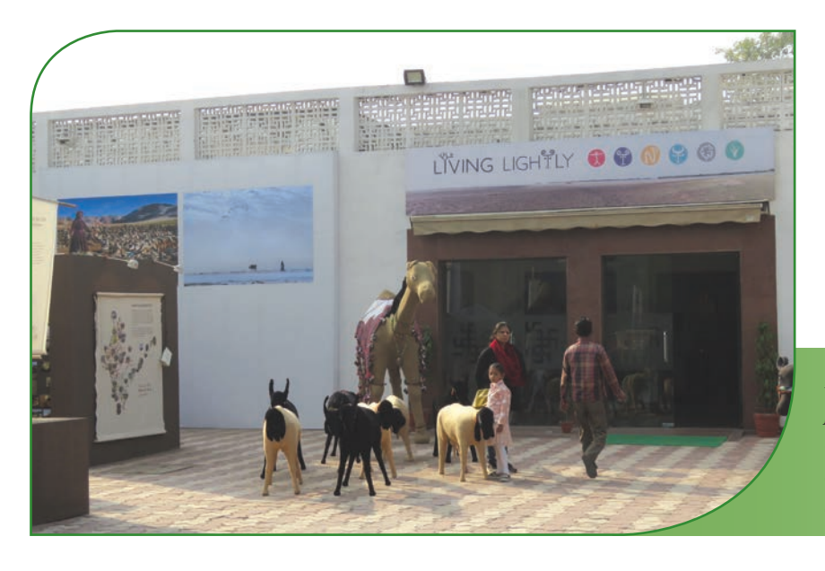
Living Lightly, a mobile exhibition on pastoralism across India, devised by communities and civil society groups, as a tool for transformation and public awareness

Staff of Saiyaren Community Radio, Kachchh, servicing 25 villages with features, music, discussions, and much else