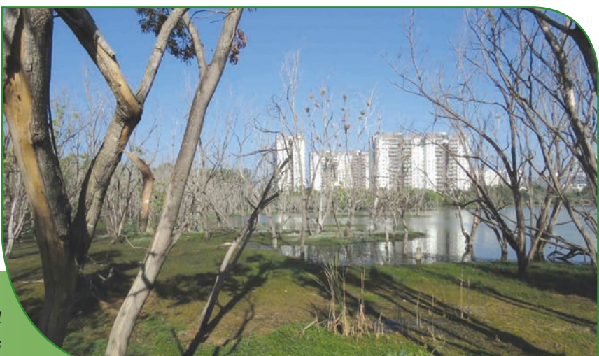
Kaikondrahalli lake, Bengaluru, revived as public space and wildlife refuge by local residents