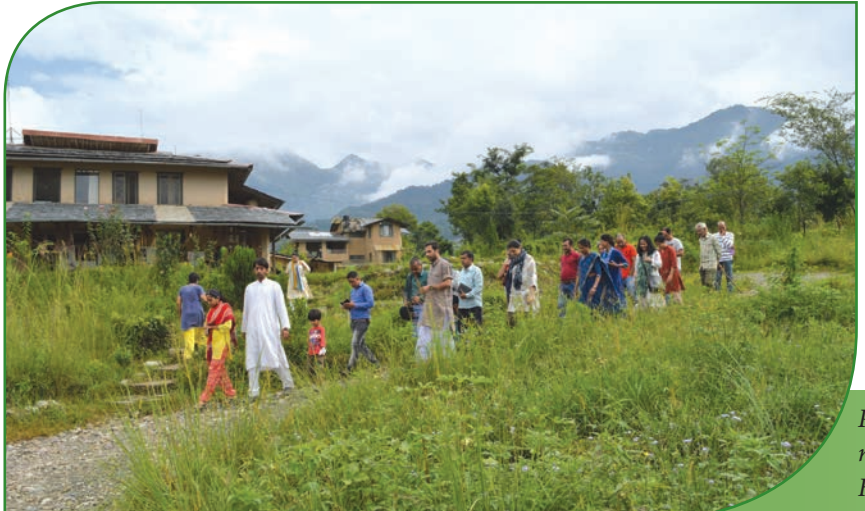
Participants of Western Himalaya mini-Vikalp Sangam at Sambhaavnaa, Himachal Pradesh, August 2016