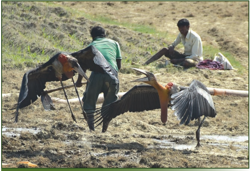
Endangered Greater adjutant storks thrive through community protection near Bhagalpur, Bihar

The following principles are laid down by the Framework (with descriptions or definitions contained therein):