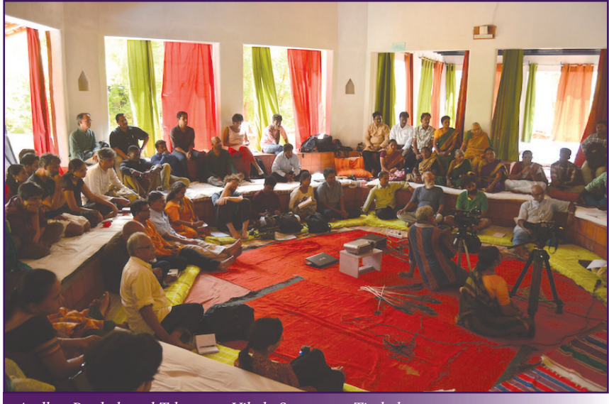
Andhra Pradesh and Telangana Vikalp Sangam at Timbaktu, October 2014