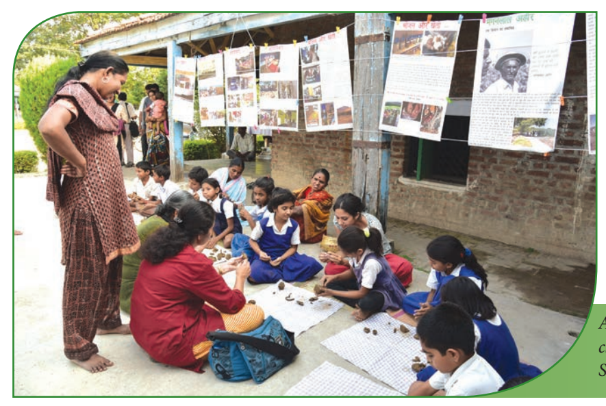
Anand Niketan students demonstrating clay work at Maharashtra Vikalp Sangam, Wardha, October 2015