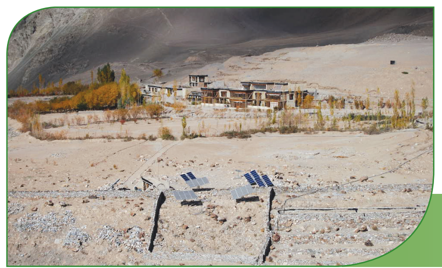
SECMOL alternative learning centre, Ladakh, powered by passive and active solar energy