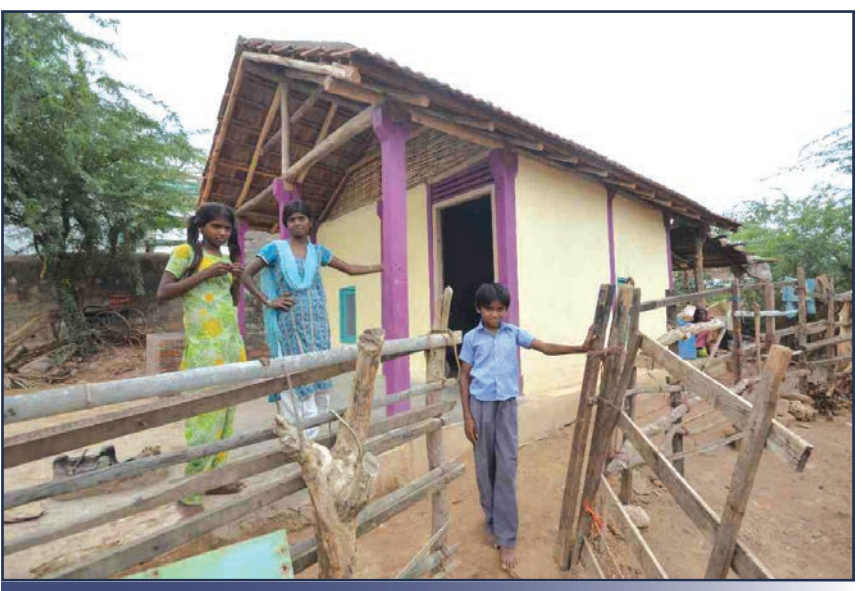
Decent housing, easy to construct, for low-income families in Bhuj, Kachchh

Of course, the framework recognises that actual initiatives towards alternatives may not fulfil all of the above. As a thumbrule, therefore, it proposes that if an initiative helps reach at least two of the above five, and does not seriously violate the others, and perhaps is even considering how to achieve those too, it should be considered as an alternative. Importantly, this is not in the form of an external judgement by anyone, but rather a process by which relevant actors can themselves come to an understanding of where they stand in the process of transformation, and what more needs to be done. The Framework, in fact, also gives examples of what kind of