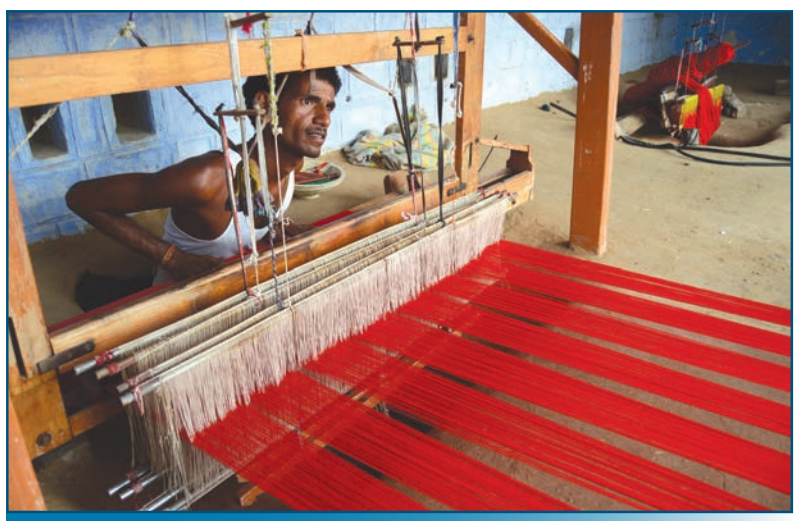
Revival of loom weaving in Kachchh sustains traditional skills and provides decent livelihoods, enabled by Khamir

and 'Not Just a Piece of Cloth' initiative has elevated cloth from its status as disaster relief material to a valuable resource that can generate earning. The initiative works with exchange of two currencies, material and labour, welcoming the old practice of barter and reducing the dependence on monetary resources