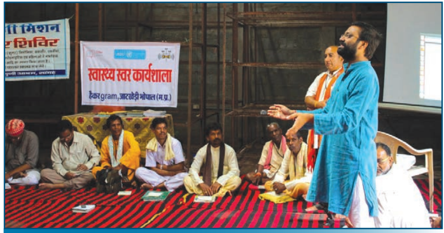
Swasthya Swara connects health workers to people in Chhattisgarh through innovative use of communications technology

Initiatives in this are those that ensure universal good health and healthcare, through the prevention of ill-health in the first place by improving access to nutritious food, water, sanitation, and other determinants of health, ensuring access to curative/ symptomatic facilities to those who have conventionally not had such access, integration of various health