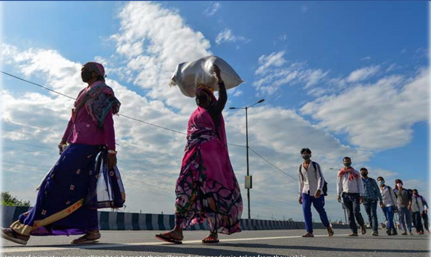
Image of migrant workers walking back home to their villages during pandemic, taken from theweek.in

But there is no end to the victims destroyed in the fire of civilization. Its deadly effect is that people come under its scorching flames believing it to be all good. They become utterly irreligious and, in reality, derive little advantage from the world. Civilization is like a mouse gnawing while it is soothing us. (Hind Swaraj)