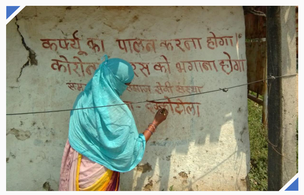
An Adivasi woman painting the walls with awareness slogans about coronavirus and social distancing

In both forest produce collection and food distribution it was important to safeguard communities from the possibility of infection. The Gram Sabhas decided to prohibit food distribution at the Public Distribution Centres in order to avoid overcrowding. Instead they decided to distribute food to each and every household doorstep, via the Gram Panchayat, after keeping the food in the sun for 48 hours. Prior to food distribution, in order to spread awareness about COVID19, the Gram Panchayats were instructed to paint slogans with health information on walls in public locations and to use a loudspeaker to share information.