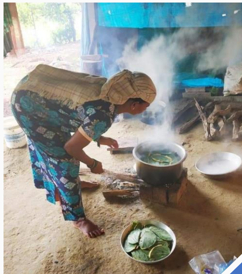
(L) Communities conserve and care for their forests; (R) Preparing a dish using diverse forest foods