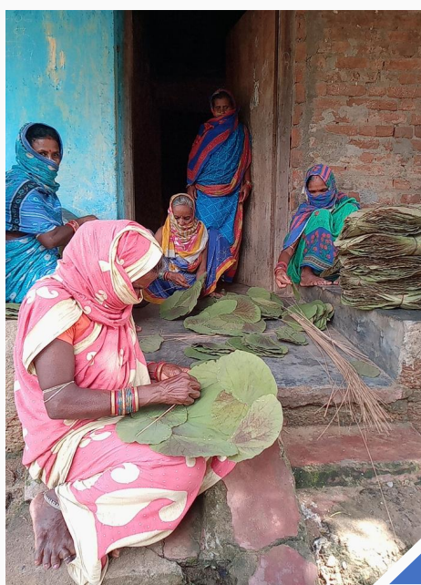
(L) A display of the Siali leaf plates prepared; (R) Women prepare Siali leaf plates