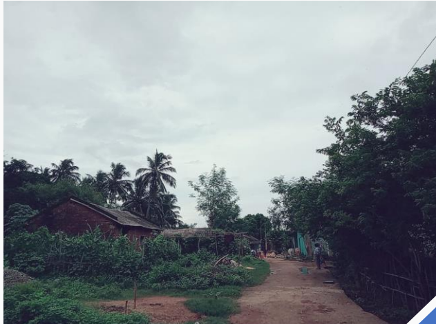
(L) The dense forests around Nathapur; (R) A portrait of Nathapur village

The Kondh Adivasi community of Nathapur village in Nayagarh district have been protecting the Tangi range forests for several decades. In fact, in the Ranpur block, women have had <u>a long tradition</u> going back to as many as 40 years of conserving forests. Despite this, their CFR rights have not been legally recognised. Nathapur villagers had realized the importance of forest and the role played by them in their lives early on, before the current climate crisis was apparent to many.