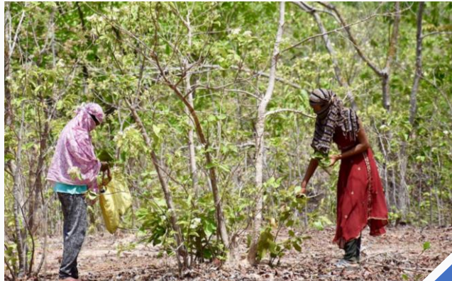
(L) Forest dwellers prepare bundles of Tendu leaf; (R) Women collect MFPs using masks and keeping safe distance

In Gondia district, 75% of the population are Adivasi, mainly Gond and Halba Adivasis. Over here, more than 250 villages have their CFR rights legally recognised, and in Deori block, 29 villages have formed a Federation to carry out their minor forest produce collection and sales. The Federation acts as an elected body that supports and assists the Gram Sabhas. It is governed by two representatives (a president and a secretary), from each of the 29 villages. Each year, the Federation ensures that collectors-the Adivasis and forest dwellers- are paid for all 11 days of their work during the season, unlike the Forest Department which would only buy and pay Tendu collectors for 2-3 days of their labour. Also, while the Forest Department, through its traders, pays collectors only INR 220 per day and seasonal bonuses are as low as INR 25, the Federation pays INR 300 per day and a seasonal bonus of INR 200.