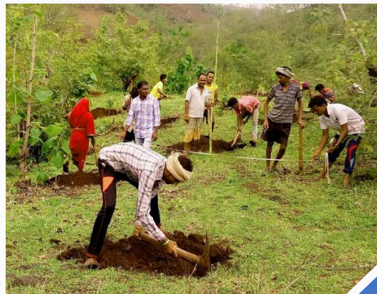
(L) Communities are employed and work for their own forest management; (R) Community planted local trees on CFR areas

Nandurbar district has the second highest acreage of CFR recognition in Maharashtra, where in April 2018, communities had titles over 2,16,723.10 acres of land. The forests have plenty of Bhutya (Gum tree/ Sterculia urens), Mahua flowers (Madhuca longifolia), Cuddapah Almond (Char tree/ Buchanania lanzan) trees and as part of CFR Management plans, the CFRMCs are guiding to plant more trees that help to support livelihood of forest dwellers.