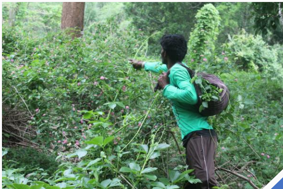
(L) Collecting Amla and other MFPs; (R) Soliga communities battle Lantana creepers, that grew alongside the teak planted by the Forest Department in earlier decades

The Soliga community, who live in and around the Biligiri Rangaswamy Temple (BRT) Tiger Reserve forest area, have a symbiotic relationship with nature. Over here, in Chamarajanagar district, CFR of 25 Gram Sabhas was recognised in 2011, and later 10 more were recognised in BRT Tiger reserve. At present, out of 61 Podus or settlements, 42 Podus of 35 Grama sabhas have their CFR legally recognised while the claims of 10 Podus are at the Sub divisional level and 9 Podus claims are at the Grama Sabha level.