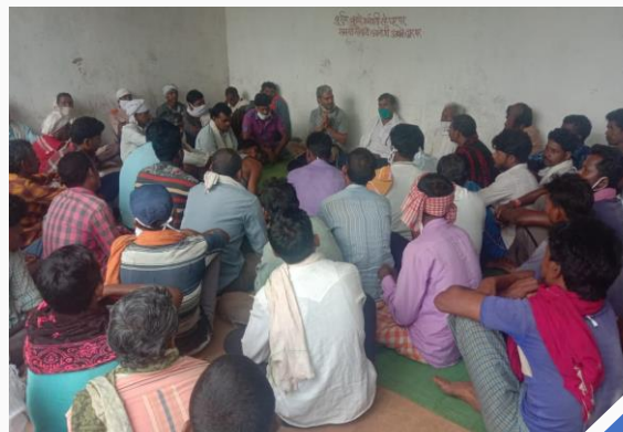
(L) Baiga women walking towards the forests; (R) A meeting of Gramdut Karyakram campaign and a Baiga Gram Sabha

Baiga Chak, an area of dense forests, is primarily inhabited by the Baiga Particularly Vulnerable Tribal Group (PVTG). There are close to 70 villages in Umaria and Dindori districts that are part of this forested belt. Since 2008, the communities with the support of the Gramdut Karyakram and Jangal Adhyayan Mandal, two campaigns working on rights-based awareness, have been working towards recognition of forest rights. While in the initial years of the campaign, individual forest rights were recognised, it is since 2017 that the campaign has focused on the legal recognition of CFRs. Currently, 10 Gram Sabhas of Dindori block have their documents and evidence ready to claim CFR. These Gram Sabhas were ready to submit these to take forward the process of CFR when lockdown was announced.