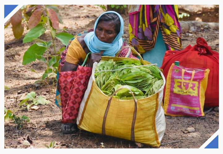
Forest Dwelling woman with the Tendu leaf harvest of the day

This year during lockdown, the Federation of 29 villages earned INR 2.5 crores by selling Tendupatta, while managing everything themselves and taking precautions against the spread of COVID19. Furthermore, the Federation had used the substantial profits from sales in 2017 of Tendupatta to rent machinery to dig ponds or waterbodies in the Gram Sabhas for rainwater harvesting. The groundwater was recharged in these areas and therefore villagers could also focus on paddy cultivation. When members of the support NGO Vidarbha Nature Conservation Society (VNCS) went to the community to provide relief kits, the community felt self-sufficient and therefore refused to accept these kits.