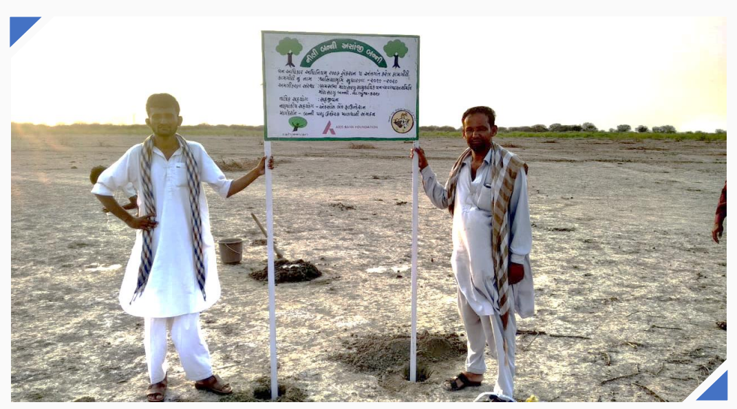
Maldhari pastoralists stand near a sign board proclaiming the Banni Grassland CFR area

The Maldhari communities are mainly dependent on indigenous livestock herding: the Kankrej cattle and Banni buffalo being the most common. Most families have 50-100 livestock, each village around 5000 and the entire area has over 1,00,000 livestock. While the pastoralist community could largely survive on their own milk production, some community members had food shortages. In