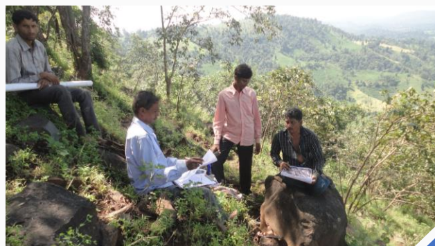
(L) Adivasi communities make their CFR management plans; (R) Mapping of Community Forest Resources

This story is about a cluster of 24 villages situated in the eastern-most part of Dediapada block in Narmada district. All these villages are exclusively Adivasi villages, predominantly inhabited by Vasava tribe, with some Tadvi tribe families in two villages. These villages are also a part of Shoolpaneshwar Sanctuary, which was declared in three phases- in 1982, 1987 and 1989- on 61,542.40 hectares of forest land, and has a total 104 villages, including 25 uninhabited villages.