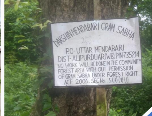
(L) A board at the entrance of Kodal Basti, proclaims Community Forest Rights!; (R) Dakshin Mendabari self-proclaims Community Forest Rights

While CFRs are still officially unrecognised by the government of West Bengal, the Adivasi communities- Rawa, Santhal, Oraon, Mech and Koch and other forest dwelling Van Taungya communities, living in and around the Jaldapara National Park and Buxa Tiger Reserve in Alipurduar district in West Bengal, have been accessing and conserving the forests for several years.