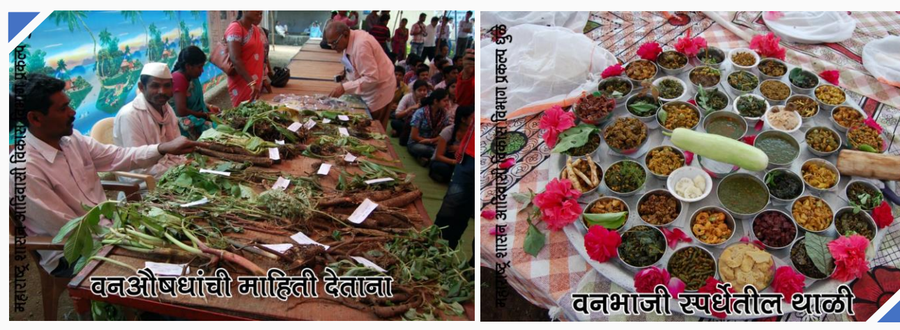
Villagers of Baripada are self-dependent on their own agriculture and forests

In 2017, the individual forest rights (IFRs) and CFRs of around 130 Kokni and Bhil Adivasi families, residents of Baripada village, Gram Panchayat Manjri, in the District of Dhule were legally recognised. Since the forests here are not very dense, villagers are agriculturalists and grow grains and vegetables throughout the year.