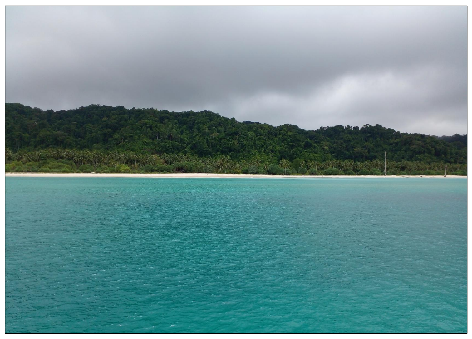
The picture taken at Gandhinagar Bay depicts some common features of the eastern coastline of Great Nicobar – two tiers of thick rainforest canopy with pandanus and coconut lining the shore. The dead trees trunks seen on the right are reminders of the 2004 tsunami.

An analysis of the responses to parliamentary questions raised in the Monsoon Session of 2024