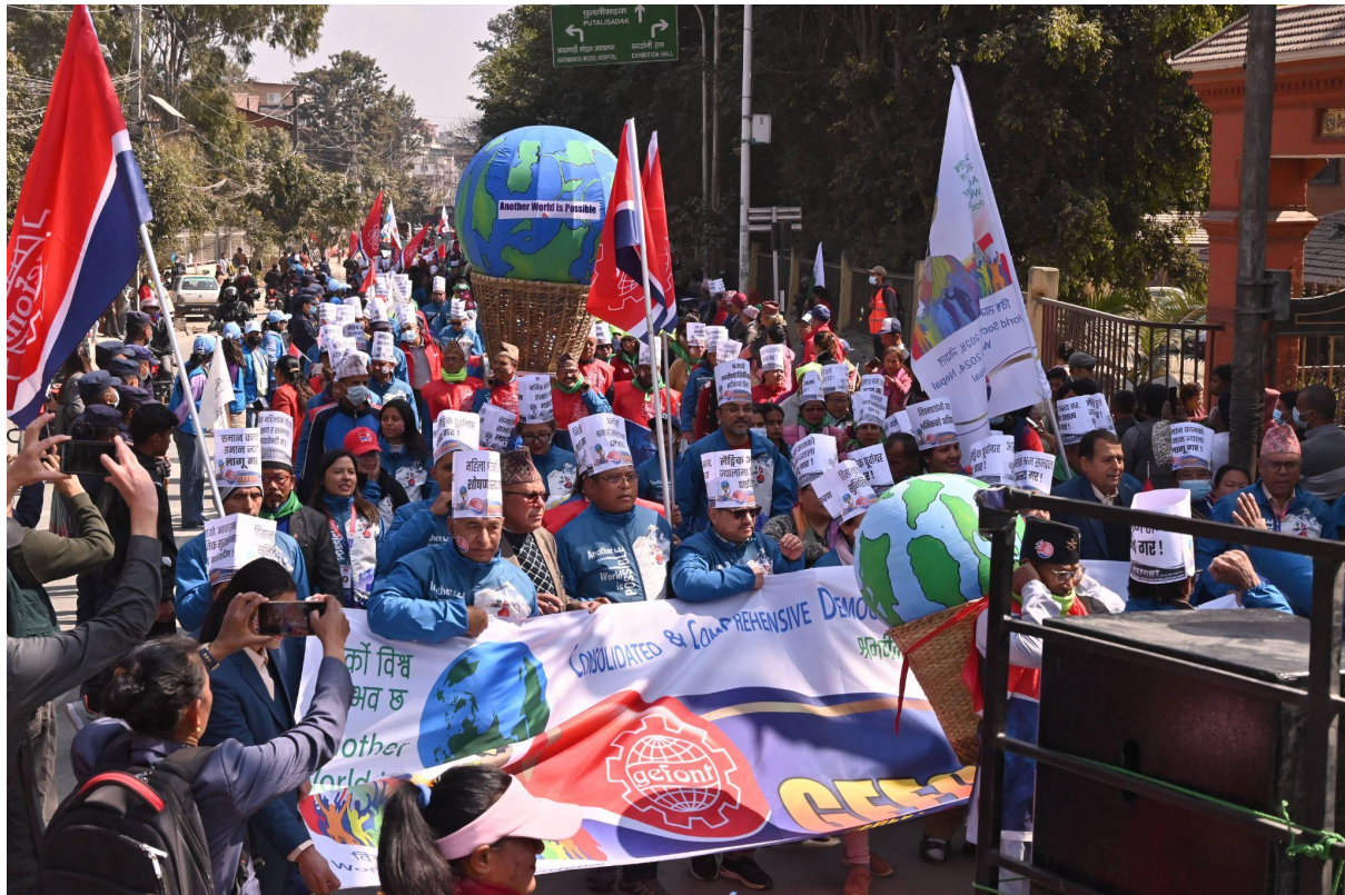
World Social Forum, 15th-19th February 2024