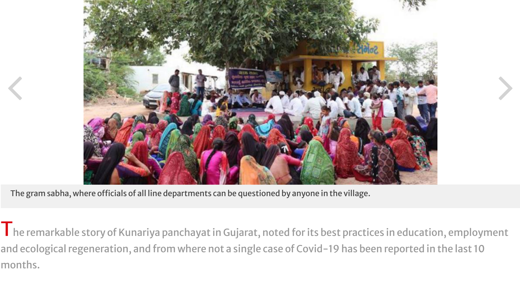
The gram sabha, where officials of all line departments can be questioned by anyone in the village.

The remarkable story of Kunariya panchayat in Gujarat, noted for its best practices in education, employment and ecological regeneration, and from where not a single case of Covid-19 has been reported in the last 10 months.