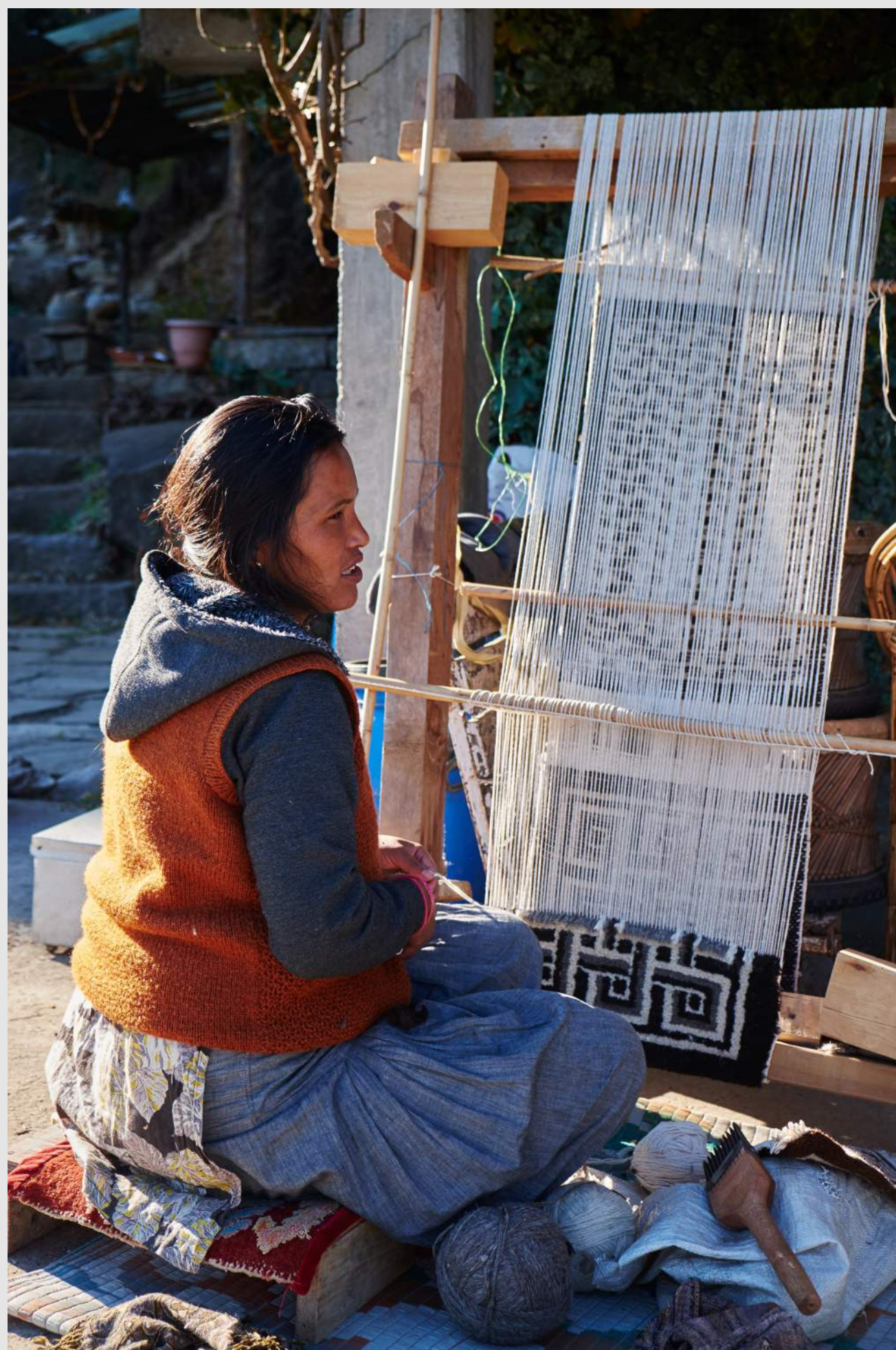
Left: Women are still the backbone of rural life in India, with significant contributions in household work, agriculture and resource management; and more recently, in politics and as drivers of social change.

Middle: Members of Maati Sangathan in Sarmoli, Uttarakhand.