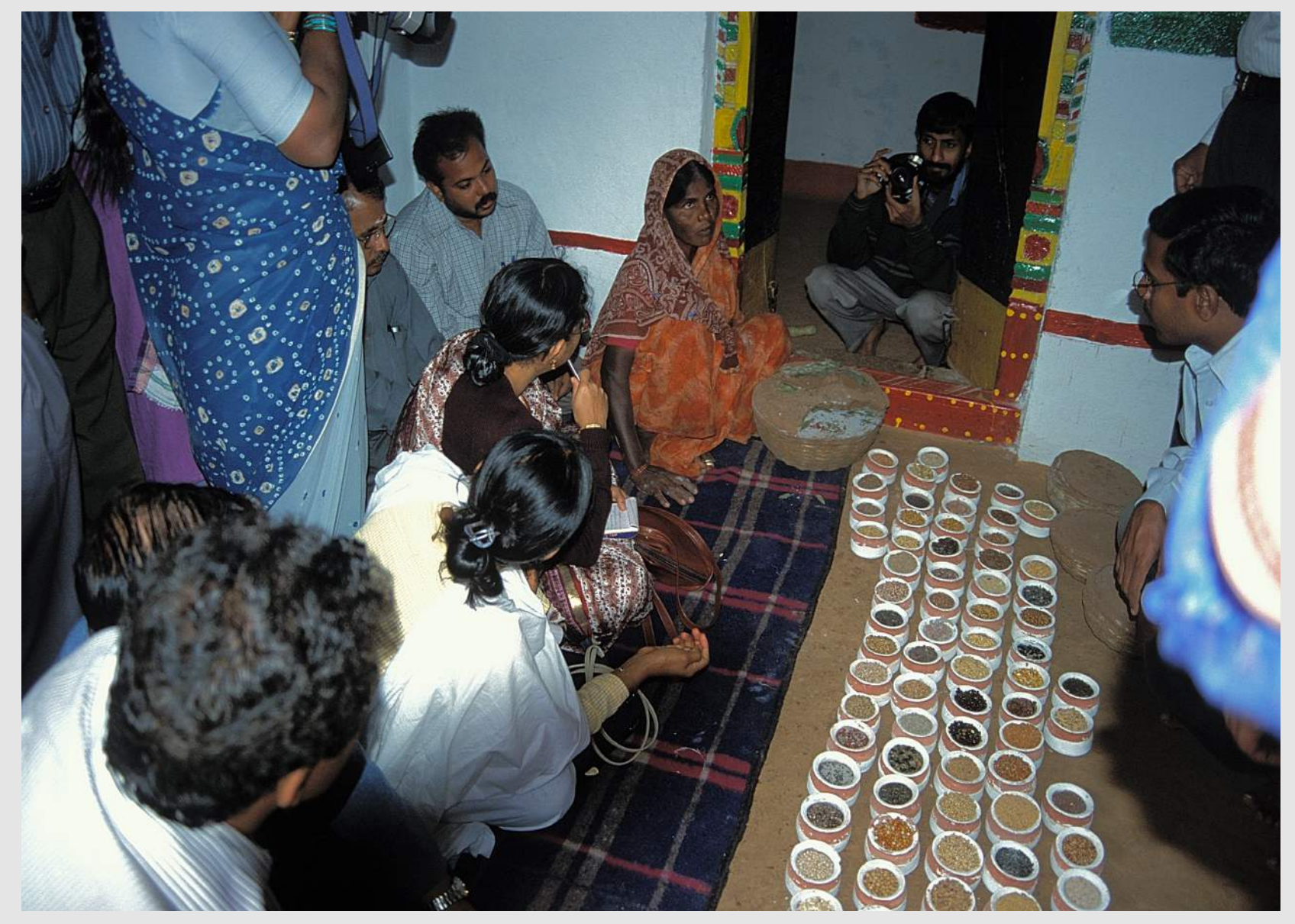
Above: Traditional seed variety conserved by the women of Deccan Development Society (DDS).