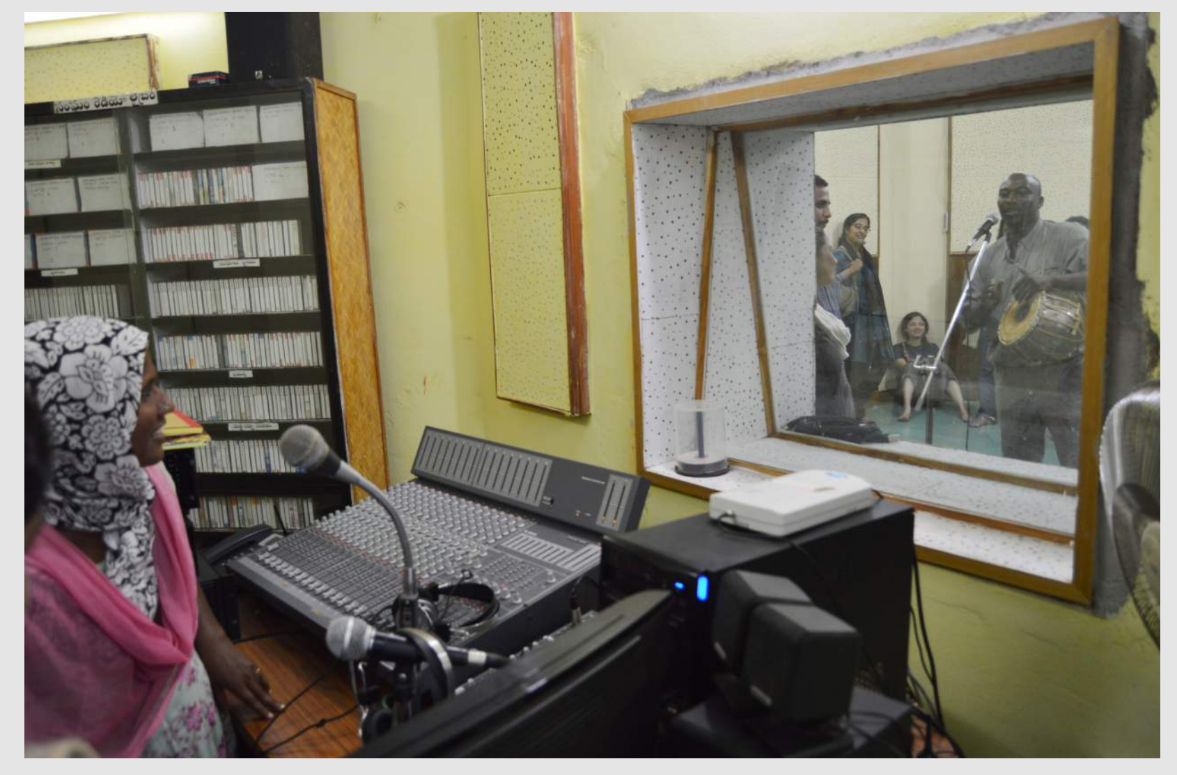
Above: Reaching out through community radio, part of DDS's programmes.