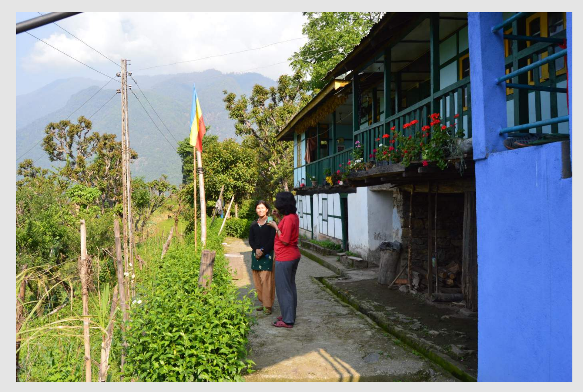
A homestay in Yuksom, Sikkim.

Ecotourism is a global industry that offers varied opportunities and contains characteristic risks. On the one hand it can contribute significantly to local communities' livelihoods, create an invaluable appreciation for their natural resources and offer opportunities for genuine cultural exchange; on the other, if the 'eco' component is superficial, as it often is, it can threaten the very foundations on which it depends, whether of culture or nature, and introduce the logic of profit-at-all-costs over time.