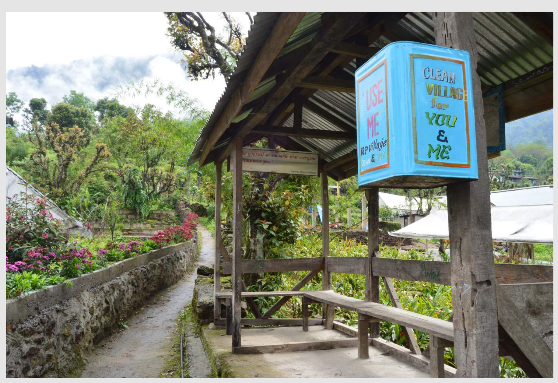
Garbage bins in Yuksom, which now also has a waste segregation center.

An example in Sikkim tells the story of a recovery from some of these less desirable traits of ecotourism. In 1996, local youth of Yuksom - the gateway village to Khangchengzonga National Park - set up the Khangchengzonga Conservation Committee (KCC) with a view to make treks into the park more sustainable. The committee introduced the idea of 'zero waste trekking' and organises homestays for visiting tourists. In conjunction with the Forest Department, it banned the use of firewood by trekking operators and instead provided kerosene stoves. In addition, plastic waste is recycled and sold as products at KCC's education center.