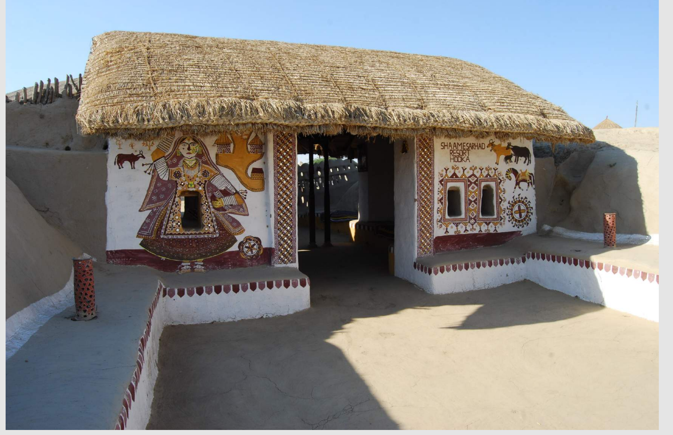
Traditional art on Shaam-e-sarhad resort in Hodka, Gujarat, that uses mud and straw architecture.

In Kachchh, the village of Hodka is the gateway to the Banni landscape. Here Shaam-e-sarhad is a tourist camp built, owned and managed by the local community of Maldharis. Some of the guiding principles of the initiative are the use of traditional architecture and the conservation of local culture, including the arts, crafts and cuisine.