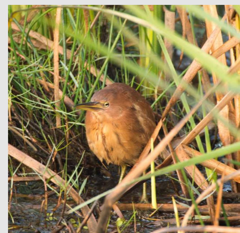
Left to right: Purple moorhen and Cinnamon bittern, two of the more charismatic of the estimated 200 species of birds who call the wetland of Mangalajodi their home.

A directory published by pune-based Kalpavriksh is the world's first country-wide compilation and analysis of CCAs (community conserved areas). It describes a diversity of initiatives, attempting to gain a deeper understanding of conservation of biological diversity, local livelihoods, peoples' rights and development, through around 140 case studies across 23 Indian states.