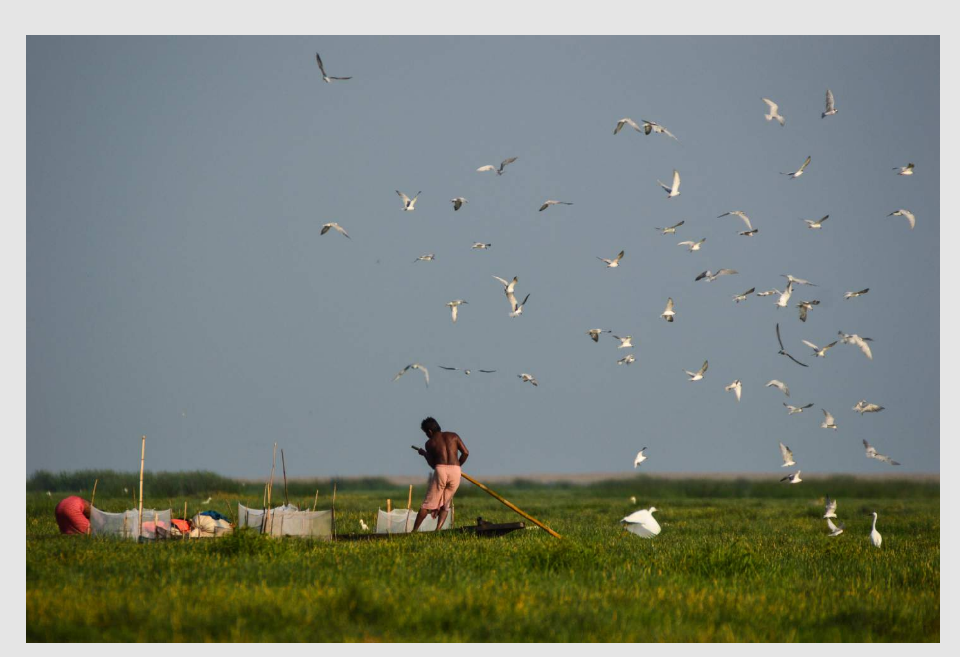
Above: Human and avian co-existence in Mangalajodi, Odisha.