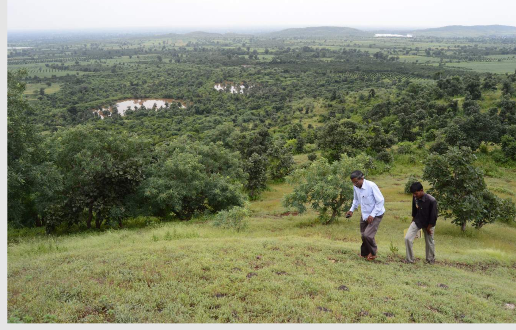
Above: The pasture-forest matrix of Nayakheda village in Maharasthra, protected legally through the Forest Rights Act, by the local community.

In the village of Nayakheda in Maharasthra, Khoj facilitated the filing of Community Forest Rights (CFRs) under FRA and the title was granted to the village in 2012. Since then the community has taken various measures to protect forests over 600 hectares, including a ban on hunting and cutting whole trees for firewood. In addition, fines are levied for grazing in non-designated areas and steps taken to mitigate fires.