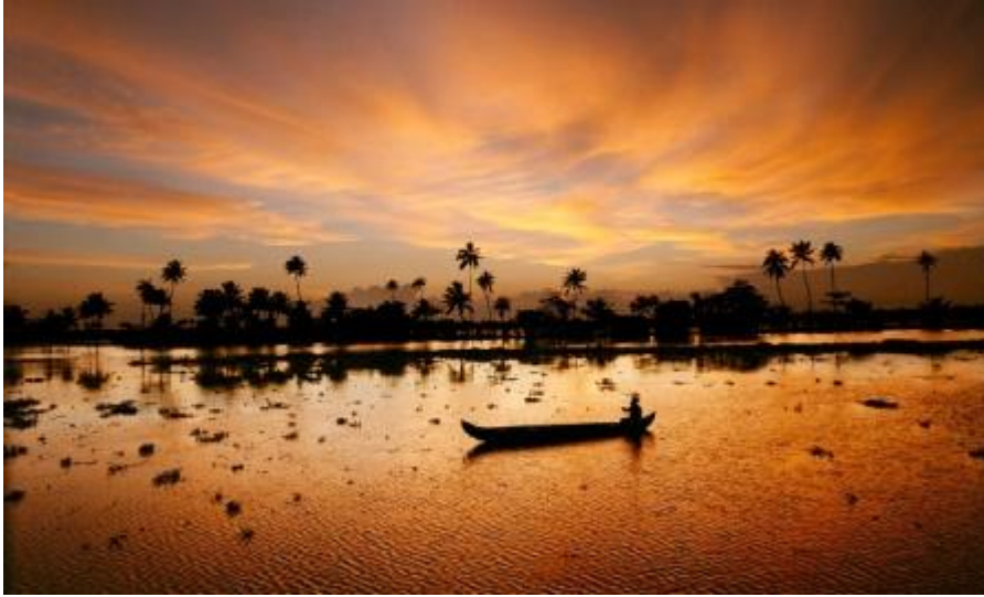
A canoe at dusk in the backwaters of Kerala, India.